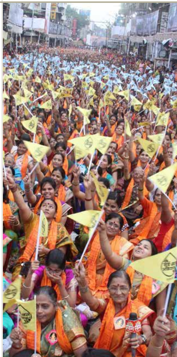
Grassroot support during the Water For All initiative, Pune, August 2014

"I have contributed a lot for water sector, but this is the first time I saw a ray of hope."