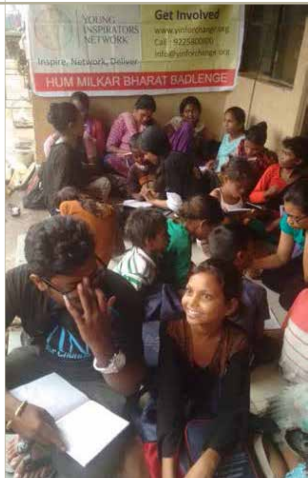
YIN team teaching slum kids, Nagpur, July 2015

“It’s heartening to see representatives of government interacting with NGOs and the private sector in achieving the same goal.”