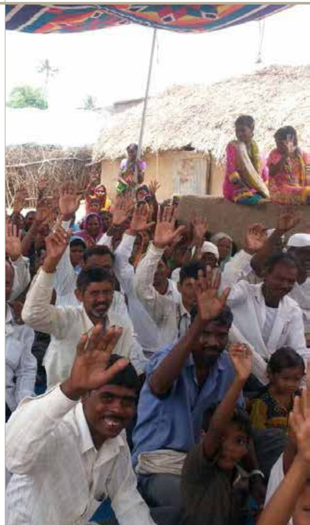
Interaction with villagers for alcohol ban in district Kolhapur, 2014

“We are sure DCF India will go a long way in addressing various important issues vis-à-vis people.”