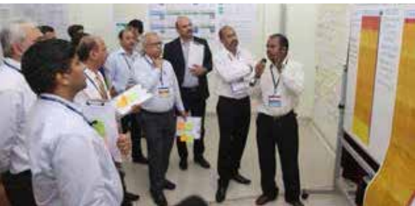
Interaction of participants of 'Water for All Lab', Mumbai, May 2014

“The lab provides a good forum for ideation and hearing of silos. It gives excellent opportunity for value addition to all participants. It’s a great chance to be a part of history, as this is a “never-before” exercise & fantastic learning process.”