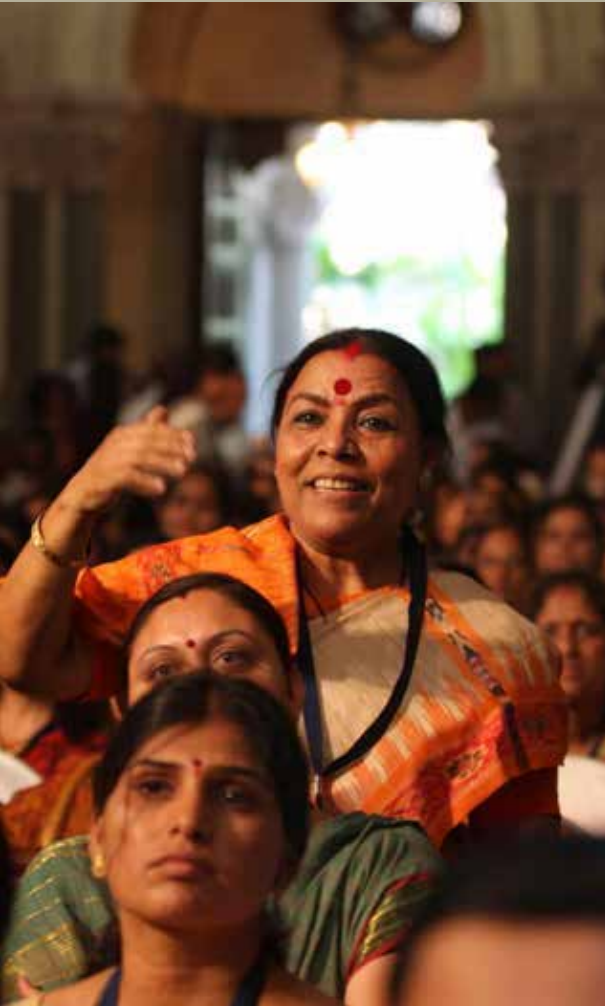
Interaction with Tanishka Ladies, 2014

“I’ve never seen or come across such a data collection and interpretation and solution finding initiative.”